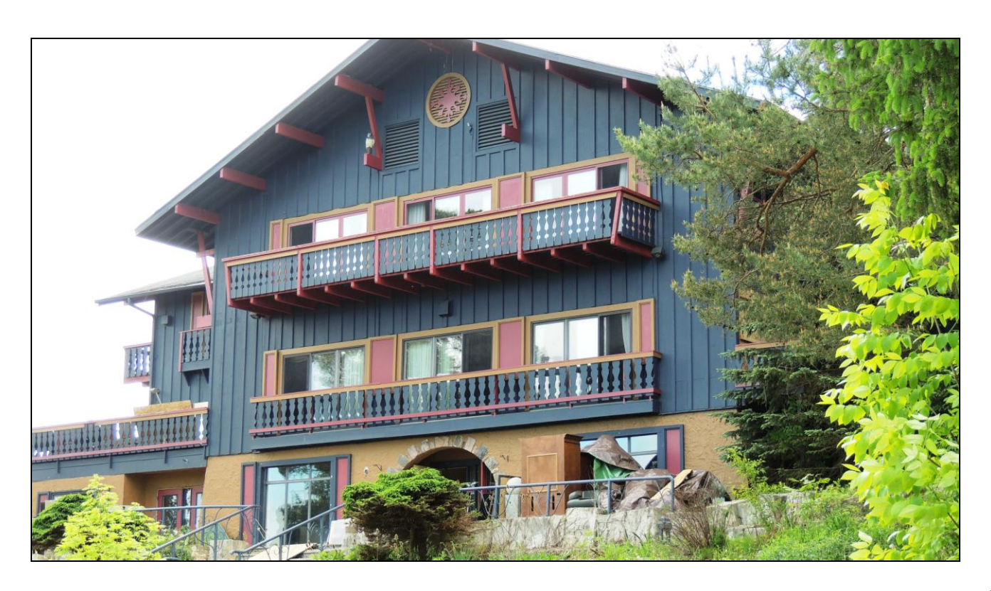
2 of 6